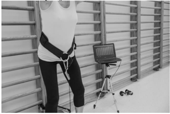
Figure 1. Training belt for attaching the load to the pelvis

exercise intensity using mass moment of inertia (MMI) of the cylindrical weight. In the group that carried out the traditional exercise, kettlebell weights were used that were held with both hands and adducted between the thighs while performing a squat.